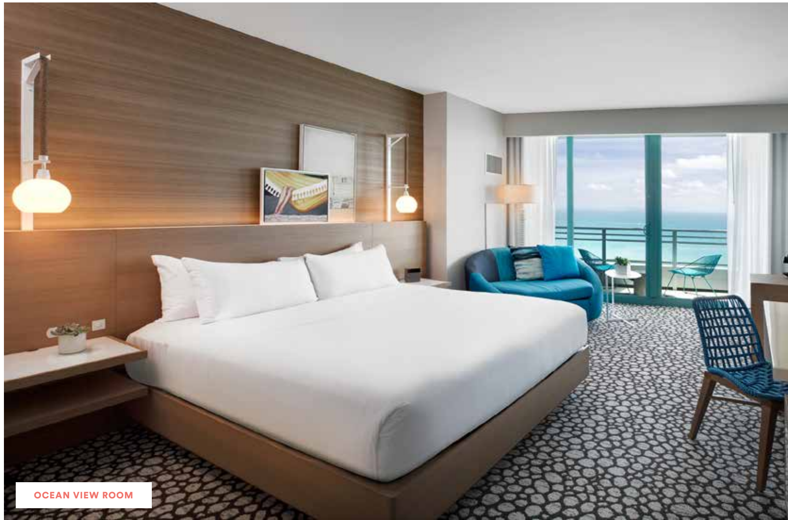
OCEAN VIEW ROOM

OUR MODERN GUEST ROOMS CAST A BEACHY BACKDROP TO ALL YOUR ADVENTURES ACROSS THE RESORT