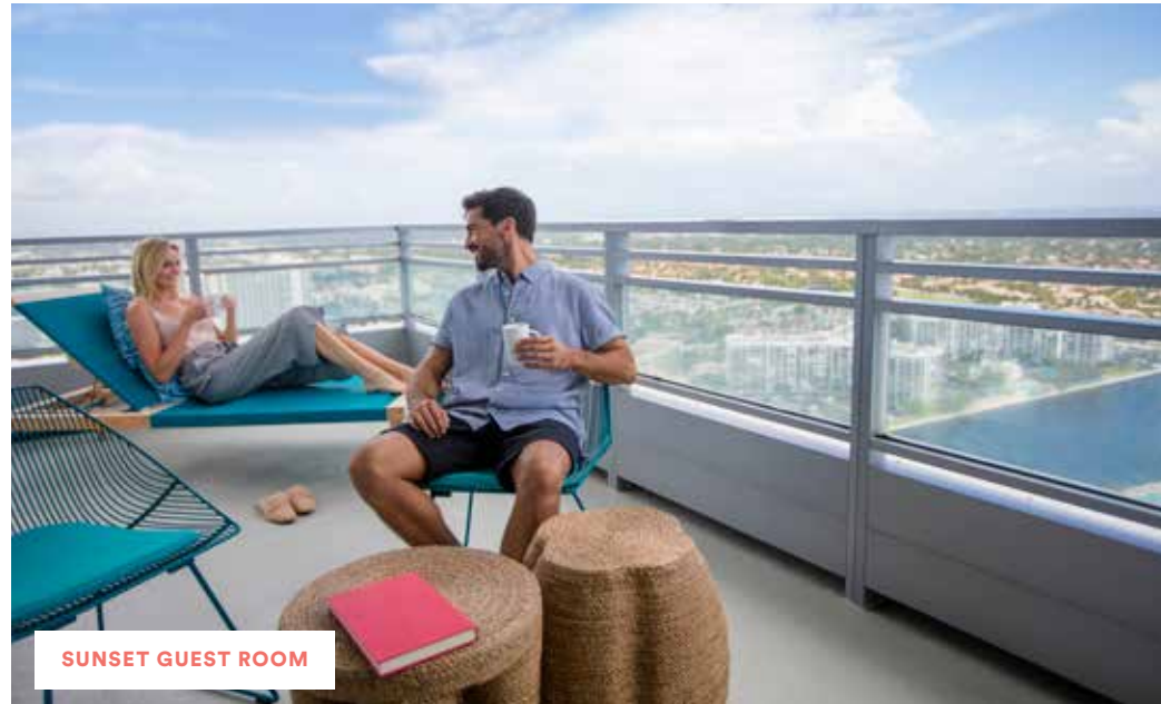
SUNSET GUEST ROOM