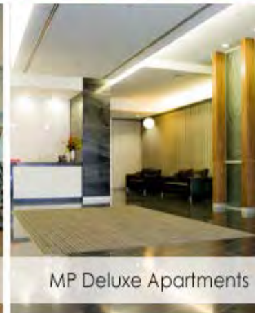
MP Deluxe Apartments