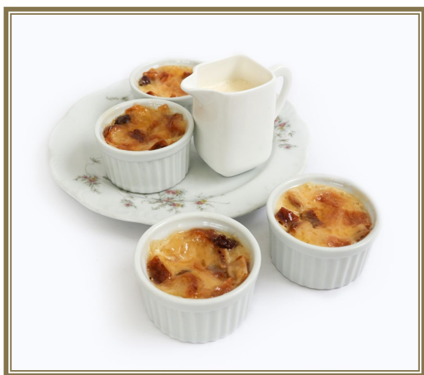
20 Bread & Butter Pudding with Vanilla Sauce