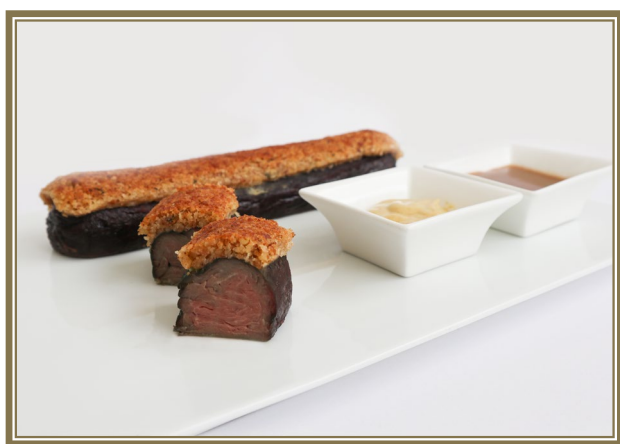
19 Maple Pecan-crusted Beef Tenderloin with Balsamic-Mustard Sauce