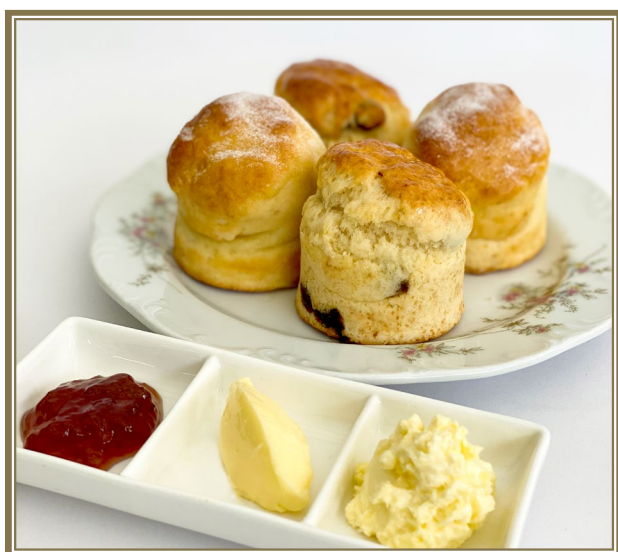
11 Plain or Raisin Scones with Devonshire Clotted Cream, Strawberry Jam & Butter