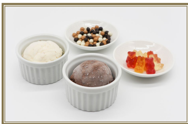
21 Chocolate or Vanilla Ice Cream with Mini Chocolate Pearls or Jelly Candies (toppings sprinkled on ice cream before serving)

Some items may contain or have come in contact with allergens. Guests may check with our staff for assistance.