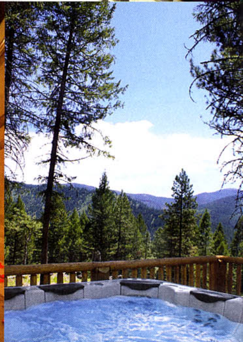
CLOCKWISE FROM TOP: Private cabanas can be reserved at The Broadmoor's pool; guests in Luxury Cabins at Triple Creek Ranch get their own deck with a hot tub; Kelly's Spa at Mission Inn invites romance.

4. Cocoon together in the mountains. Take respite in the wilderness at Triple Creek Ranch , an adults-only hideaway at the foot of Montana's Trapper Peak, where you can relax in your outdoor hot tub or sip wine in front of your fireplace. The best part: no cell phone service, so you're sure to have quiet time. WHAT YOU GET Accommodations in a Luxury Cabin; all meals, snacks, and beverages; champagne and chocolates upon arrival; a 60-minute couples massage; and all on-ranch