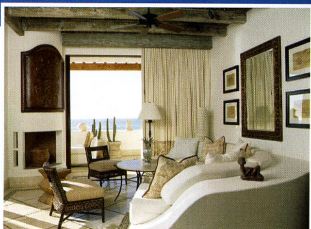
The spa suites at Spa at Las Ventanas al Paraiso offer life-changing luxury in a spectacular setting.