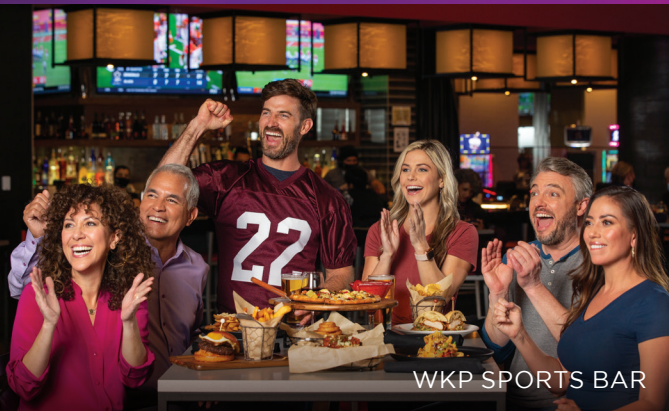
WKP SPORTS BAR