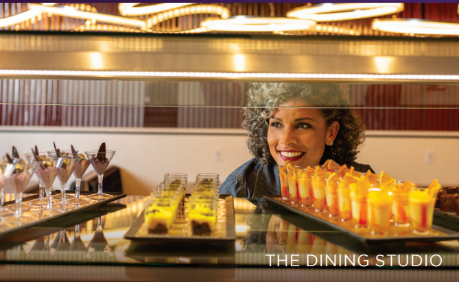
THE DINING STUDIO