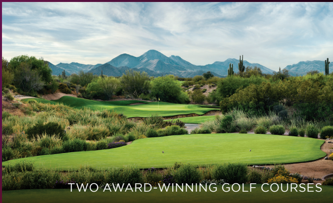
TWO AWARD-WINNING GOLF COURSES