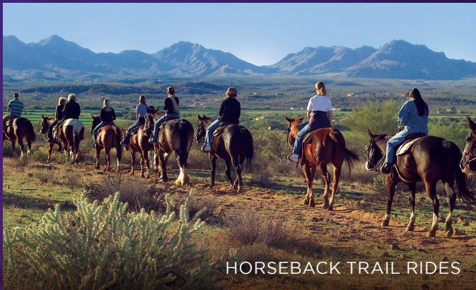
HORSEBACK TRAIL RIDES