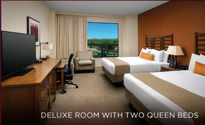
DELUXE ROOM WITH TWO QUEEN BEDS

And when it's time to turn in for the night, our hotel welcomes you with comfort in 246 rooms and suites.